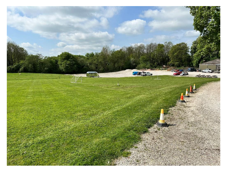
Figure 8. View of the car park and location for the marquee that will house the Month of Art competition.