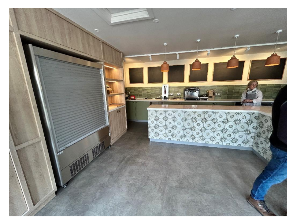
Figure 1 Cafe.

Please see photos below of the event site.