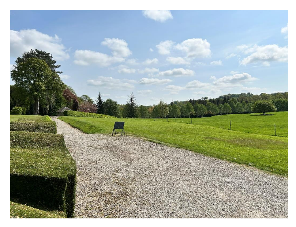
Figure 4. Drop off point for cars.