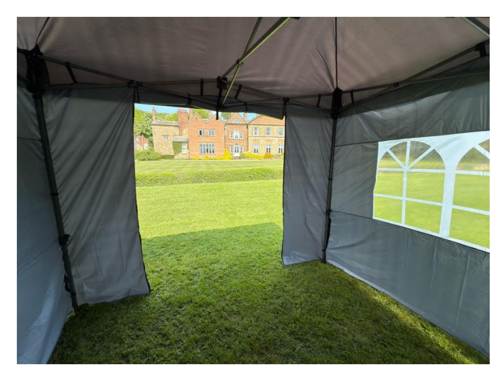
Figure 6. View from within a gazebo.