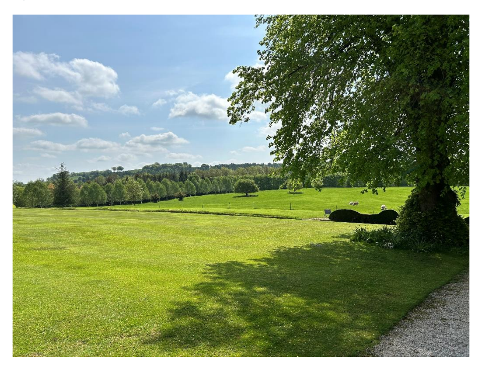
Figure 3. View towards PDA event from the cafe grounds.