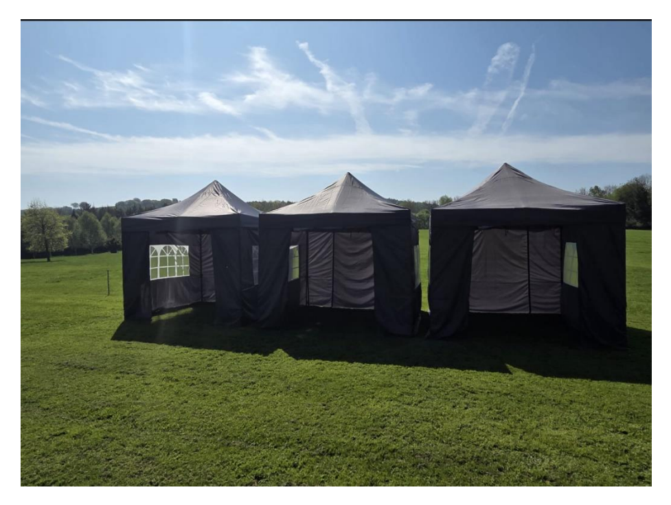
Figure 7. Gazebos purchased by Hopton Hall for the event.