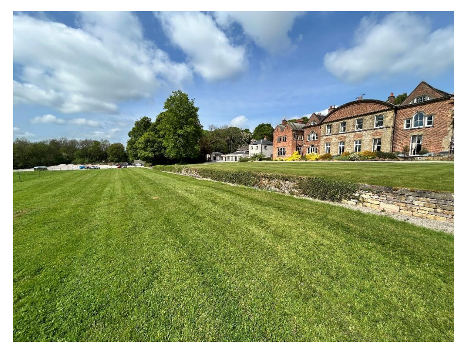
Figure 5. PDA event site. Gazebos will be along here.